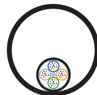
48-count loose tube fiber cable in a traditional plenum innerduct (1.0 in. ID)

The result: easier pulls, more efficient use of space and lower costs.