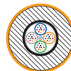
48-count loose tube fiber with Berk-Tek Armor-Tek (.712 in. OD)

Armor-Tek is 25 to 50% smaller than traditional plenum innerduct.