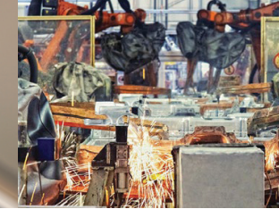
Industrial Networking & Control #1 in Ethernet sales