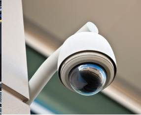
Security & A/V Largest inventory in North America