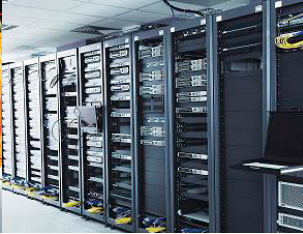
Datacom Largest inventory in North America