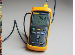
Support Products When you need us